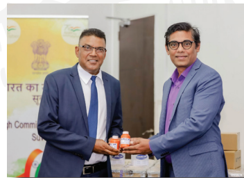
The Electoral Commission receives indelible ink from the High Commission of India

"We must take ownership and work towards a fair general election."