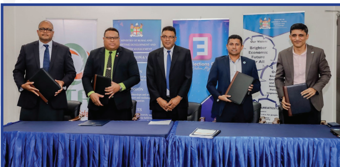
The signing of the Memorandum of Understanding with FEO and relevant stakeholders

The FEO will work in conjunction with the Land Transport Authority, Ministry of Rural and Maritime Development and Disaster Management, and Ministry of Commerce, Trade, Tourism and Transport in providing free transportation services to 101 election hubs in Fiji.