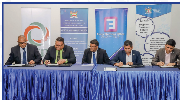
The signing of the MOU between FEO and relevant stakeholders