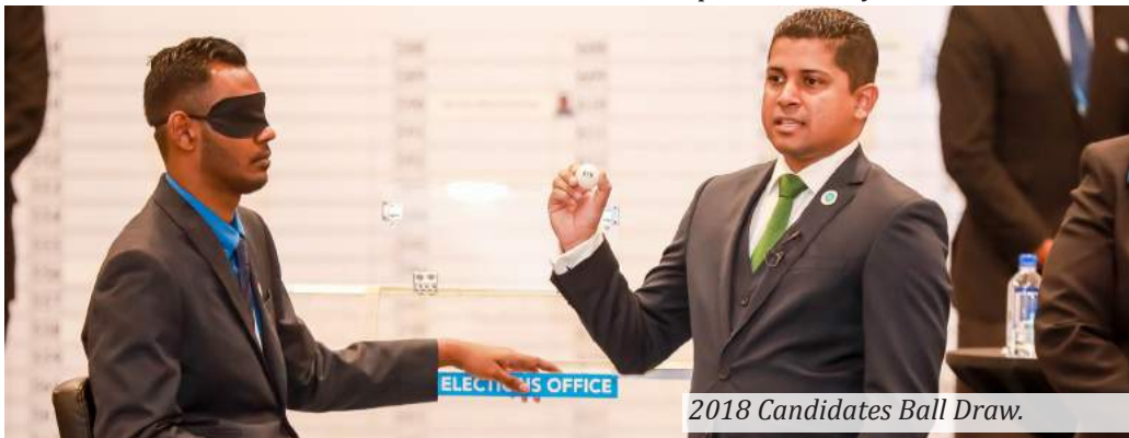
2018 Candidates Ball Draw.

If you are a candidate for the election, you will need to pay close attention to the number you have been allocated as this will be the number that will represent you and the one that voters will look out for on the Ballot Paper when they vote.