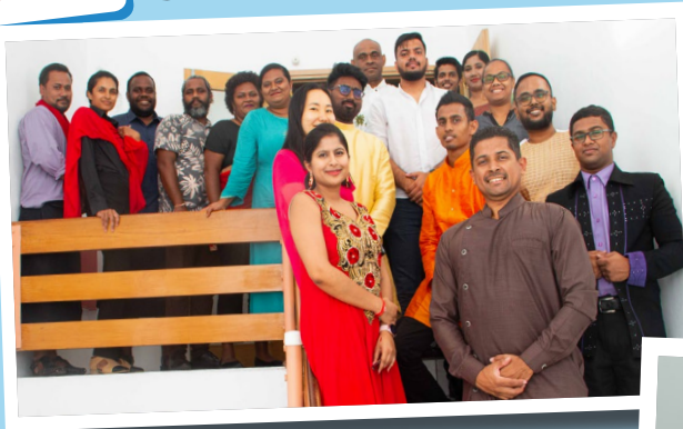
Diwali celebration at FEO.