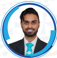
Shalvin Prakash Photographer