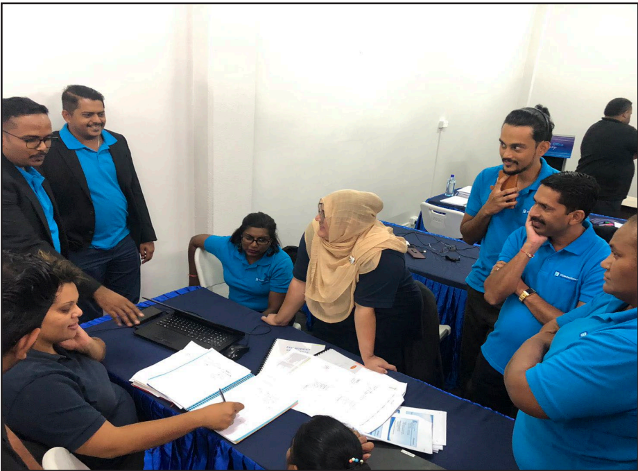
FEO staff during the Election Planning Workshop.

The FEO expects to be election ready by 15 May 2022.