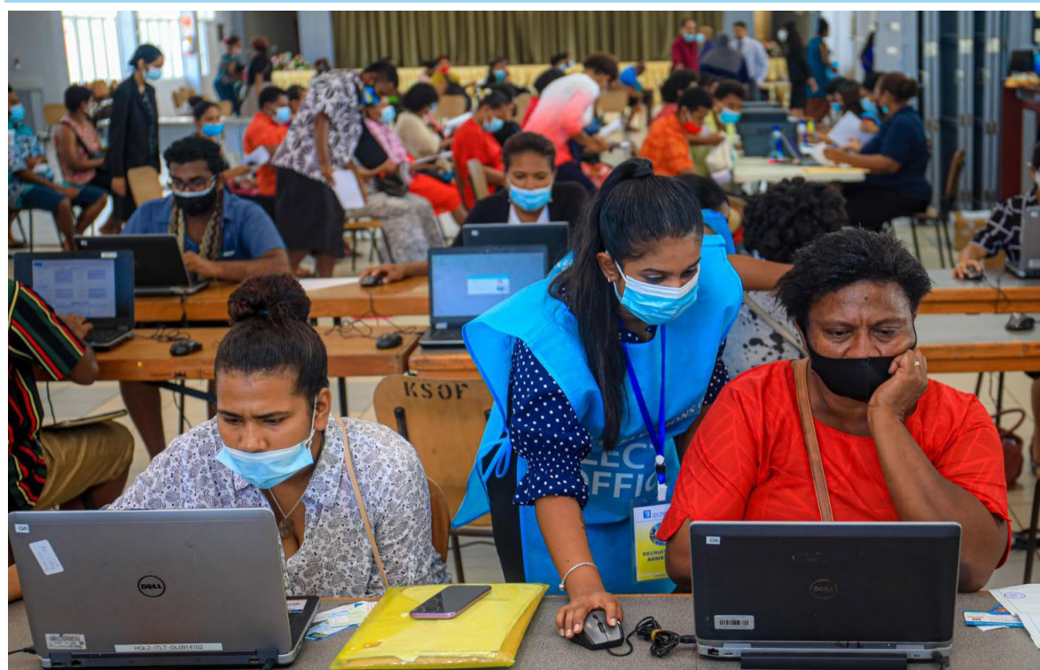
Applicants during the One Day Central Division Recruitment Drive.