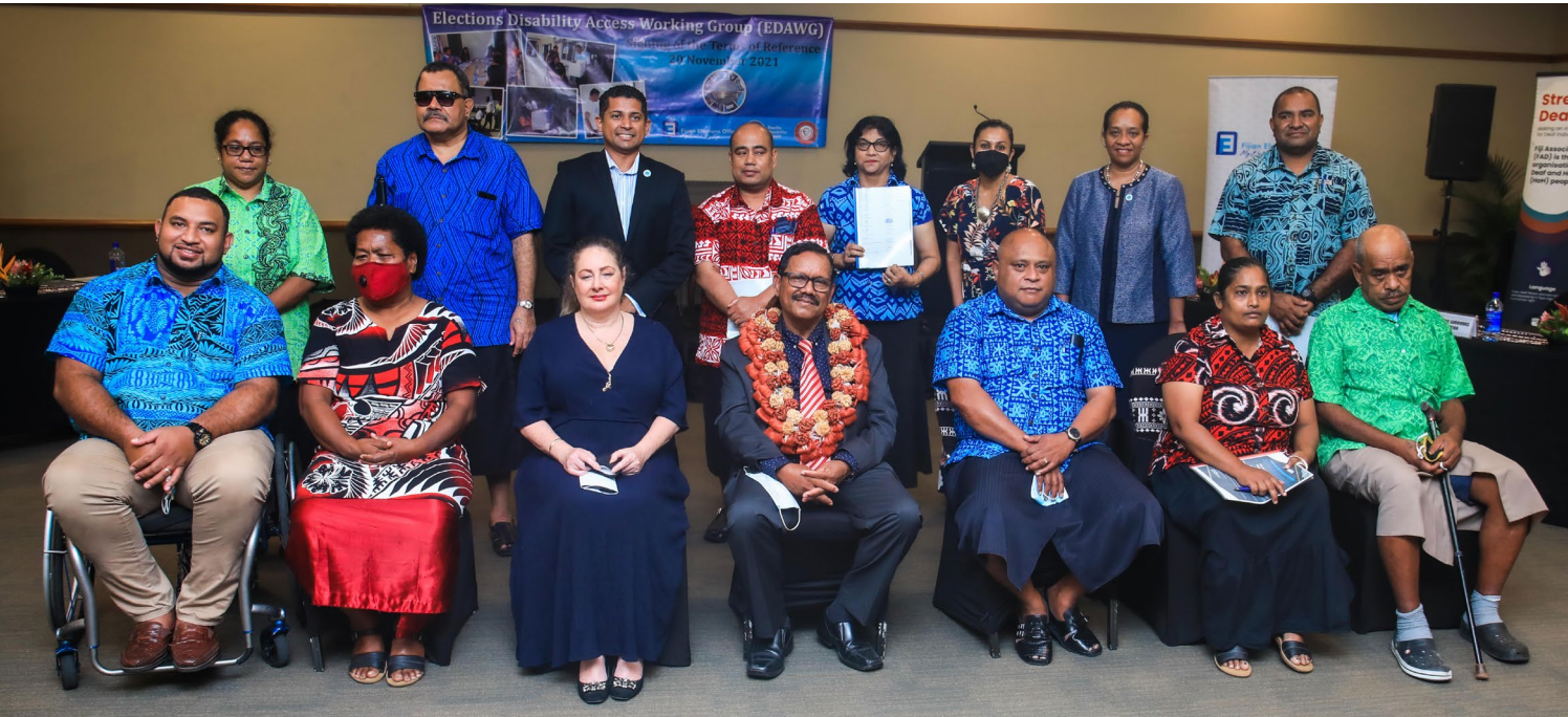
Members during the signing of EDAWG Terms of Reference for 2022 General Election.