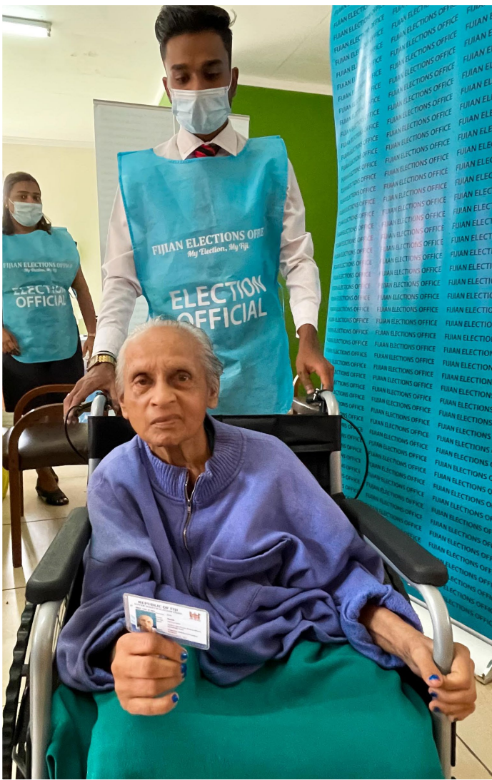
Resident of an aged care facility receives new VoterCard.

As at 02 December 2021, the FEO had conducted registrations for over 270 business houses serving approximately 14,235 voters.