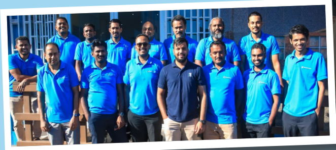
FEO Men for Movember.