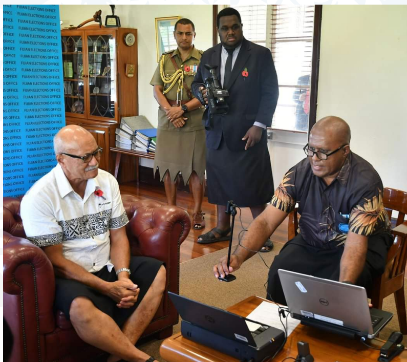
His Excellency, the President Major-General (Ret'd) Jioji Konrote updates his VoterCard at the State House.

The Business House Voter Registration Drive ends on 17 December, 2021.