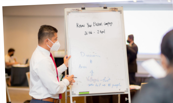
FEO team members during their 2022 General Election Planning Workshop in September.