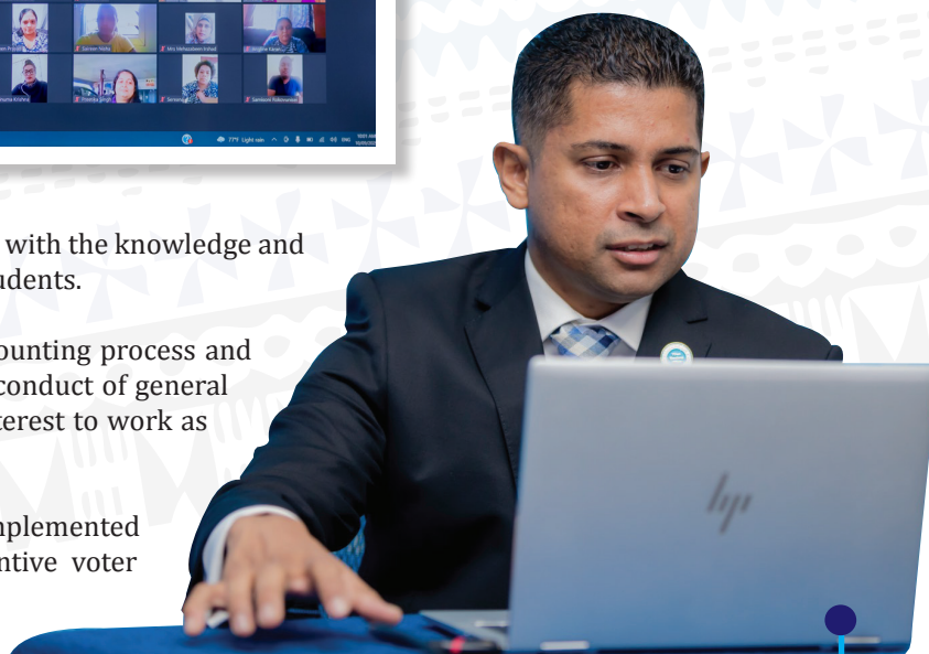
Training of Trainers Zoom session with the Supervisor of Elections