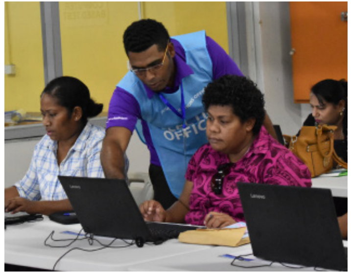
Training of Election Officials before deployment.

Interested individuals can apply online via jobs.feo.org.fj