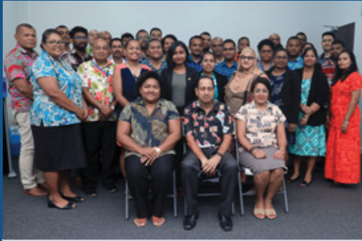
Training for all staff on the procedures and processes relating to Acquittals and Claims was conducted at the FEO HQ in February.