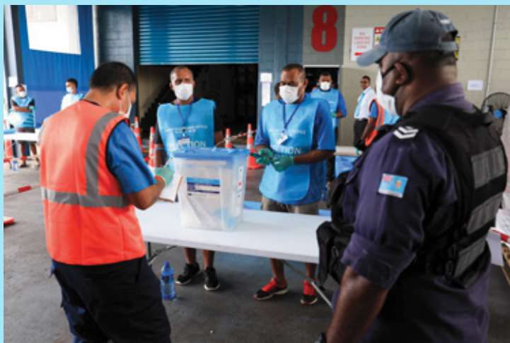
A Police Officer observes staff whilst they sort materials from the ballot box.

Since the destruction process was undertaken during the COVID-19 pandemic, social distancing protocols and other preventative measures were strictly followed throughout the 9 day process.