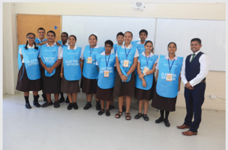
SoE with the student Election Officials.