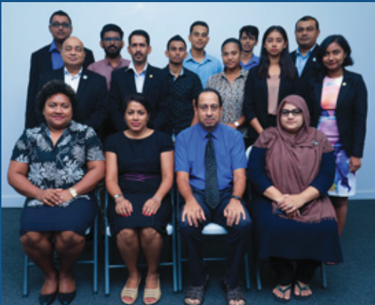
An Induction Workshop was conducted for all new staff in March.