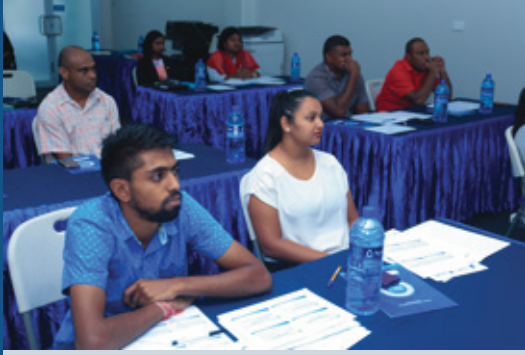
A VSC Refresher Training was held in February for selected staff.