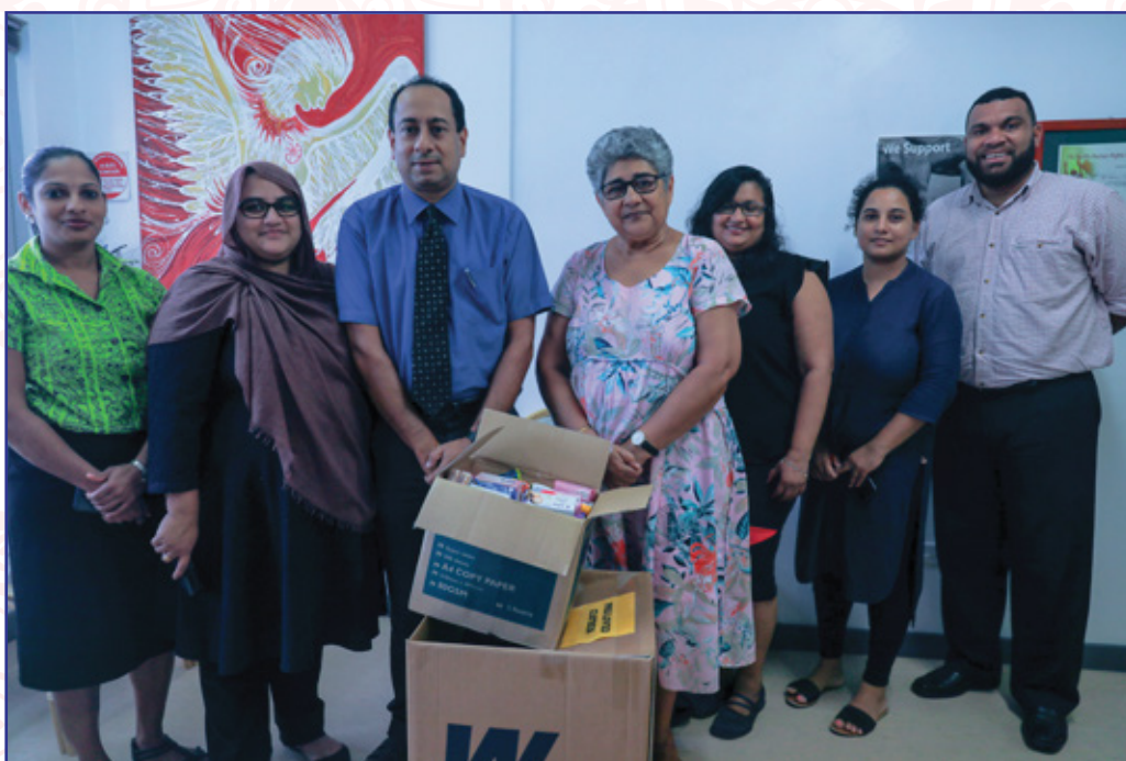
The FEO delegation presenting the donations to the FWCC team.

The FEO delegation later learned that many of these women left their homes with nothing but the clothes on their backs, so the donations were indeed a timely blessing.