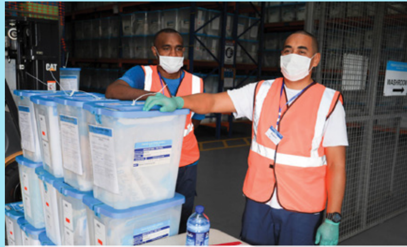
The FEO team at the warehouse.

The destruction process of approximately 9 tons of sensitive materials, including ballot papers from the 2018 General Election, commenced in late March.