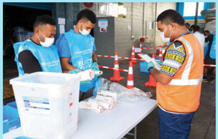
The FEO team sorting out materials for destruction.