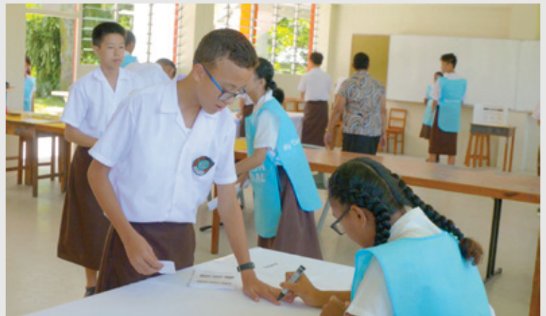
Yat Sen Secondary students during the Student Body Elections.

A Student Supervisor of Elections was appointed together with other Election Officials from the Year 10 batch to carry out the electoral process, while the rest of the students got an opportunity to vote for the student leaders who would represent them in 2020.