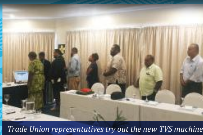
Trade Union representatives try out the new TVS machine