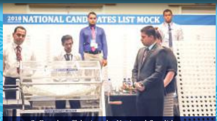
SoE and staff during the National Candidates List Ball Draw Mock Exercise