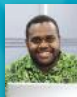
Jiuta Bogiso Photographer