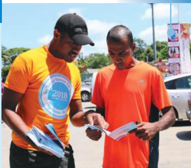
Aseri handing out the Election Information Booklet

https://www.feo.org.fj/statement-by-the-chairperson-of-the-electoral-commission-kye-awareness-campaign-launch/