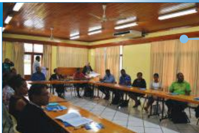
Voter Awareness Assistants Attend Training in Suva