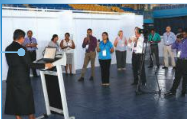
A mock Press Conference at the Vodafone Arena