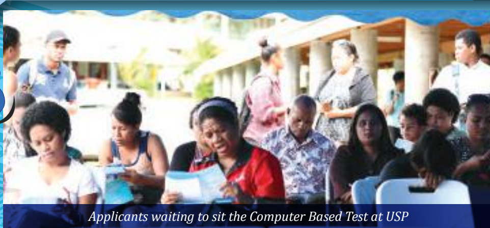
Applicants waiting to sit the Computer Based Test at USP