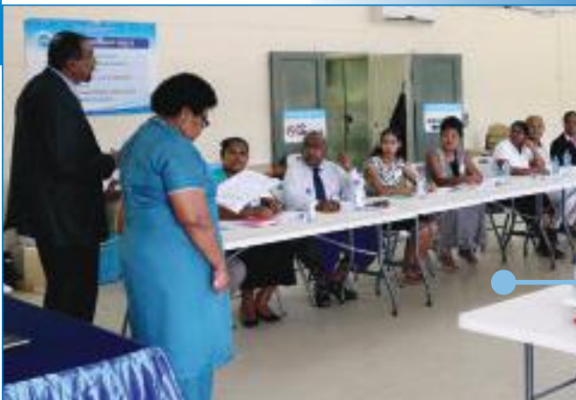
Election Officials attend PO Training

https://www.feo.org.fj/presiding-officers-training-launch-statement-by-the-supervisor-of-elections/