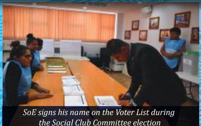
SoE signs his name on the Voter List during the Social Club Committee election