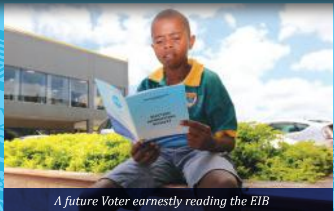
A future Voter earnestly reading the EIB