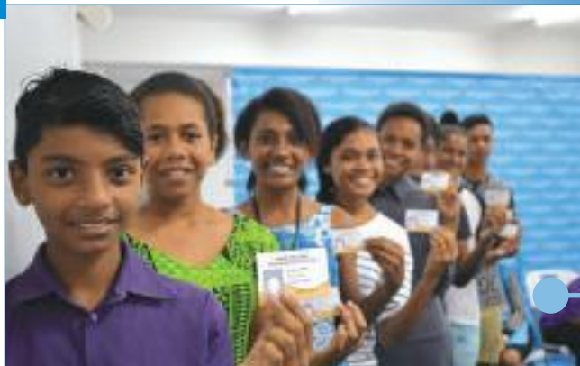
Year 10 students at the launch of the Learning Module

https://www.feo.org.fj/a-learning-module-for-year-10-social-science/