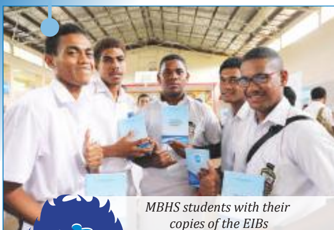
MBHS students with their copies of the EIBs

"The Awareness sessions were a learning programme for the students. There is a need to attract the youths in the community as they can be assets to the drive, in explaining the content of the booklet to the elders because they can easily follow the presentations and in turn explain these to elders in the communities".