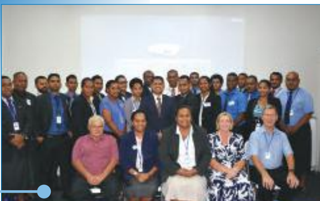
Technical Consultants, SoE, Directors, Divisional Managers and Area Officers