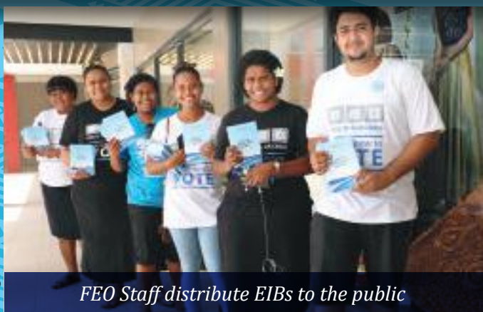
FEO Staff distribute EIBs to the public

The training was held for a week to train the Area Officers on the how to manage the office, how to execute an election plan, how to manage election materials and practical sessions on the EMS system on the logistic modules.