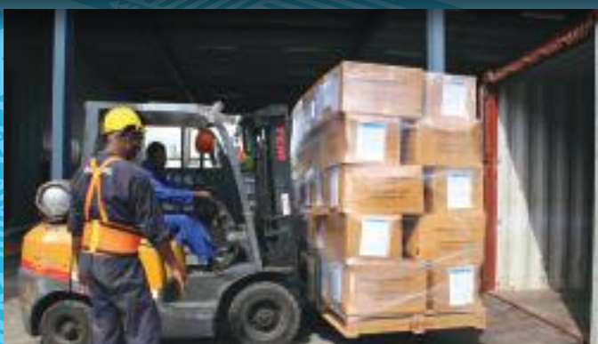
Loading of the Polling kits during the Mock Election