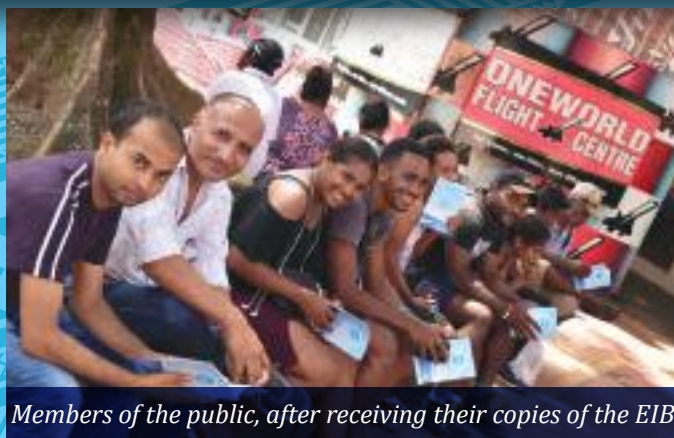
Members of the public, after receiving their copies of the EIB