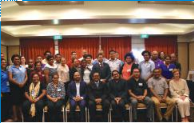
Organisers and participants at the Media Workshop

https://www.feo.org.fj/media-workshop-2018-speech/