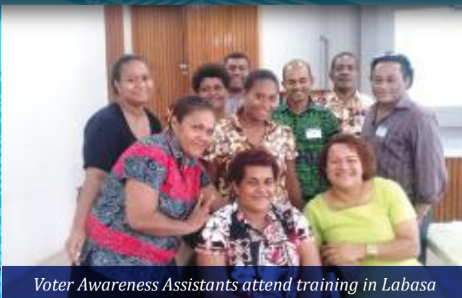
Voter Awareness Assistants attend training in Labasa