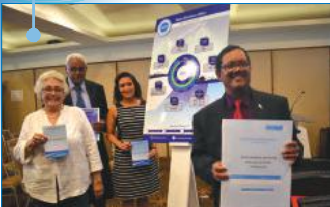
Commissioners Launch Publications

https://www.feo.org.fj/publications-launch-event-by-the-electoral-commission-and-the-fijian-elections-office/