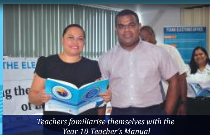
Teachers familiarise themselves with the Year 10 Teacher's Manual