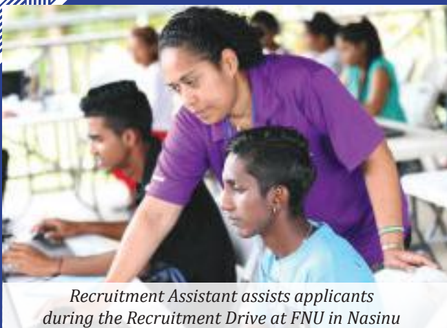
Recruitment Assistant assists applicants during the Recruitment Drive at FNU in Nasinu