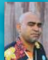
Ronald Mario Graphics

HEADQUARTERS 59-63 High Street Toorak, Suva. | P. O. Box 2528, Govt Bldgs, Suva. | Phone: +679 331 6225 | Fax: +679 331 6026