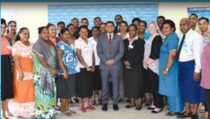
PO Training Launch at FNCDP