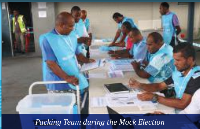
Packing Team during the Mock Election