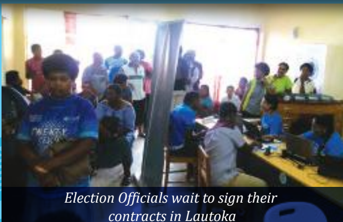
Election Officials wait to sign their contracts in Lautoka