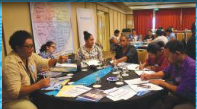
Media Personnel attend Training