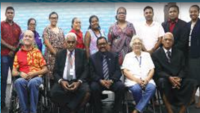
EDAWG members meet with the Commissioners