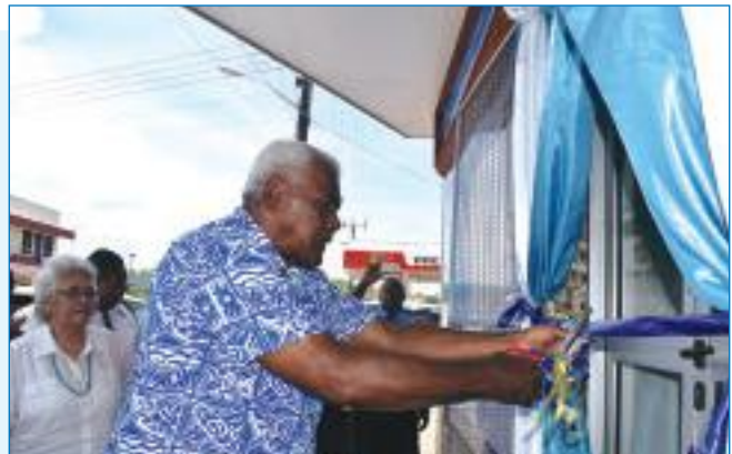
Rakiraki Voter Services Centre