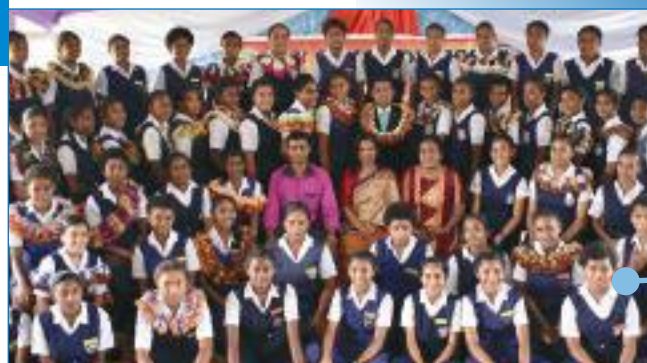
DAV Girls College Prefects Induction