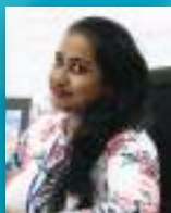
Sagufta Janif Website