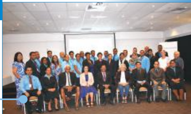
Commissioners, Technical Consultants and senior FEO Staff at the Election Planning Workshop

After the Mock Election exercise by the Fijian Elections Office, the Commissioners and the Senior staff met at the Holiday Inn on the 23rd of February to analyse the whole exercise. In this workshop, they identified arrears of improvement that they need to work on before the day of Election. The Supervisor of Elections stressed, "we need to be ready when the Government announces the day of election".