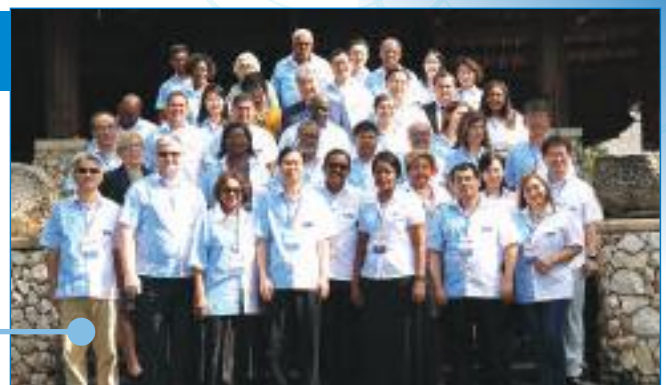
Commissioners and AWEB members meet in Nadi

The Fijian Elections Office has won the bid to host the next Executive Board Meeting of the Association of World Election Bodies (AWEB). AWEB is a global organisation of Election Management Bodies (EMBs) and it is the largest affiliation of EMBs in the world. It is critical for the FEO to invest into such large scale events to showcase that Fiji is one of the best hosts to host major international events under the AWEB.