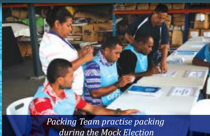
Packing Team practise packing during the Mock Election