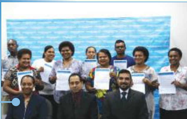
Election Officials after signing their contracts in Suva

https://www.feo.org.fj/election-officials-contract-signing-ceremony/