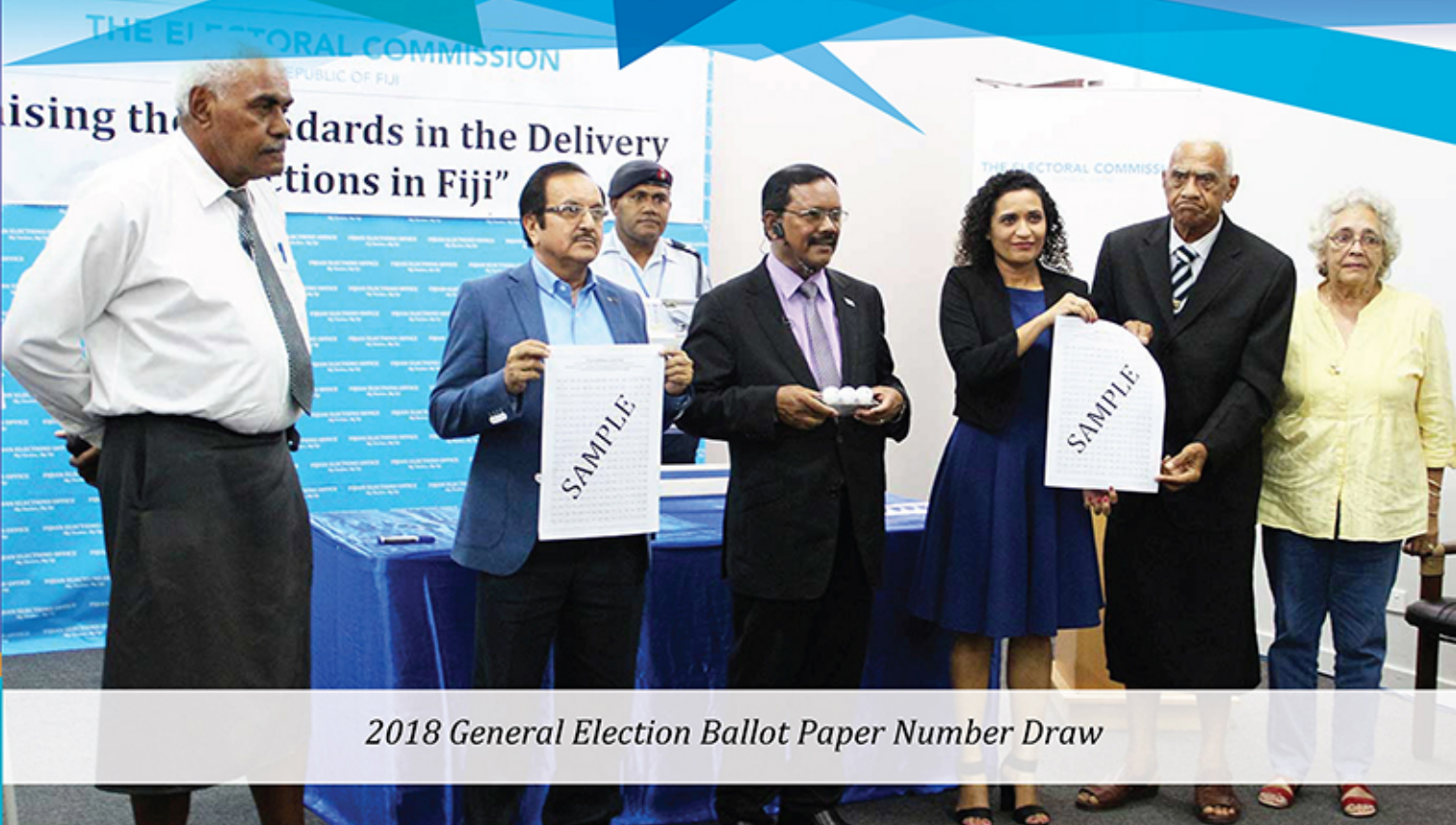
2018 General Election Ballot Paper Number Draw