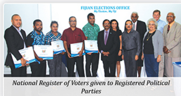
National Register of Voters given to Registered Political Parties

The Electoral Commission has printed copies of the National Register of Voters as at 19 April 2017 for Registered political parties.