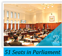
51 Seats in Parliament