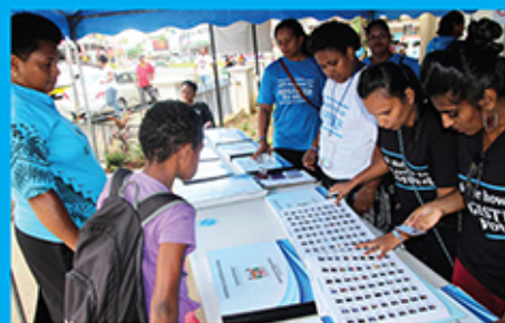
Members of the public verify their details on the National Register of Voters, during the Outdoor Broadcast at the Government Information Referral Centre in Suva.

Visit our Website www.feo.org.fj for more information