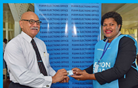
The President – His Excellency, Major General Jioji Konousi Konrote with his new VoterCard.