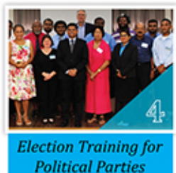
Election Training for Political Parties