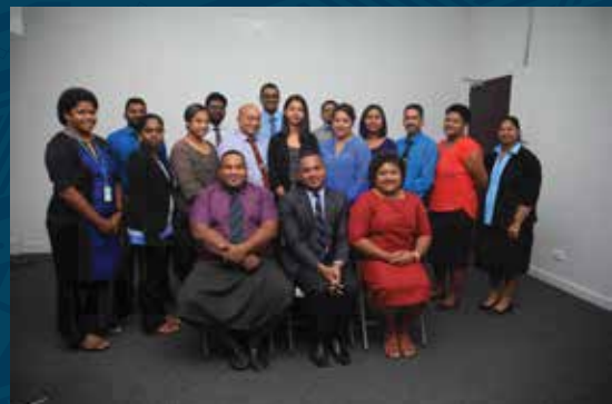
Participants during the Returning Officers Training in September.