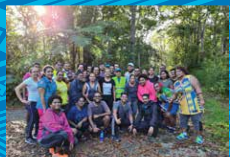
The FEO team during their expedition to Colo-I-Suva