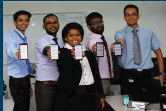
The FEO staff with their careFIJI Apps.