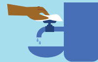
USE TOWEL TO TURN OFF FAUCET