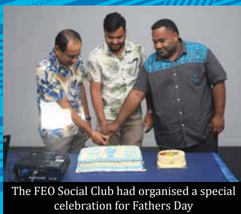
The FEO Social Club had organised a special celebration for Fathers Day