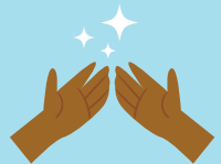
YOUR HANDS ARE CLEAN