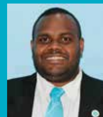
Jiuta Bogiso Photographer