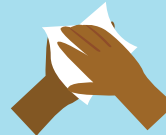
DRY WITH TOWEL