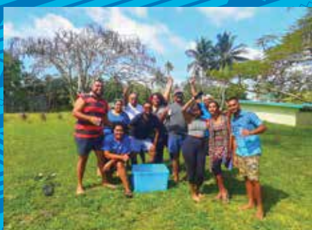
FEO staff during their team bonding trip to Nukulau Island