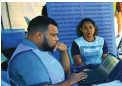
An FEO staff conducts registration during the Voter Festival

The FEO commemorated the International Day of Democracy by launching a two-day Voter Festival at the Suva Voter Services Centre ["VSC"].