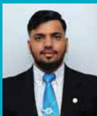
Asim Khan Graphics