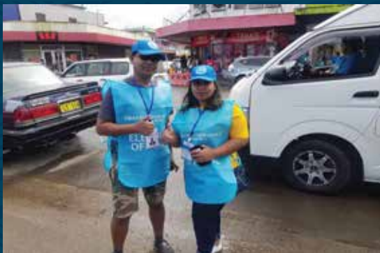
The FEO Voter Survey team during their visit to Nausori.