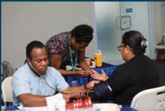
The FEO hosted a Blood Drive and Health Screening for staff in July.