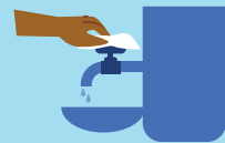
USE TOWEL TO TURN OFF FAUCET