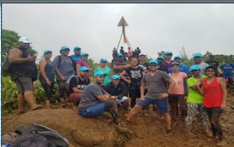
FEO staff during their trip to Mt Korobaba in June.