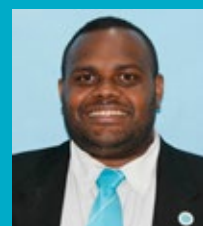
Jiuta Bogiso Photographer