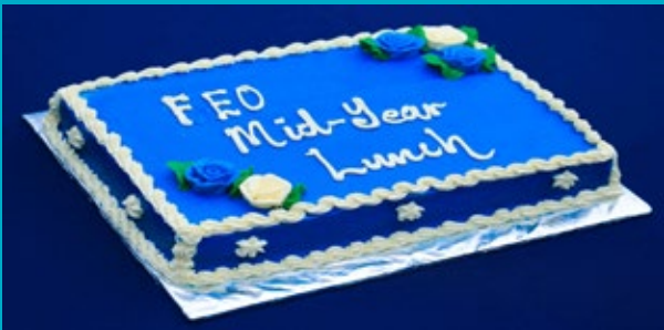
The FEO Social Club organised a Mid Year Staff Lunch at the HQ in June.