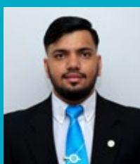
Asim Khan Graphics